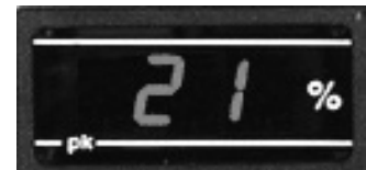
8902 Digital Hygrometer