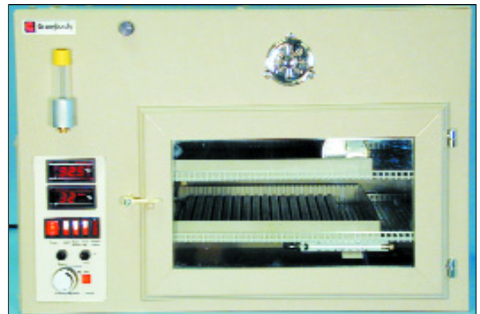
8014/01/02 Compact S84 with digital thermometer and digital hygrometer.