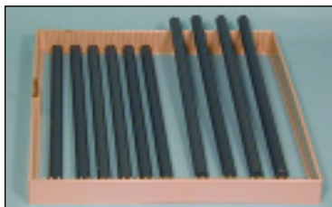
Roller tray with 10 rollers

Lyon Technologies, Inc. will carry spare parts and accessories and will provide repair service for current owners of Grumbach machines. Please contact us for advice before sending a unit back to us.