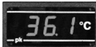
8901 Digital Thermometer (Centigrade)