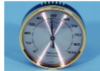
8904 Hair Hygrometer