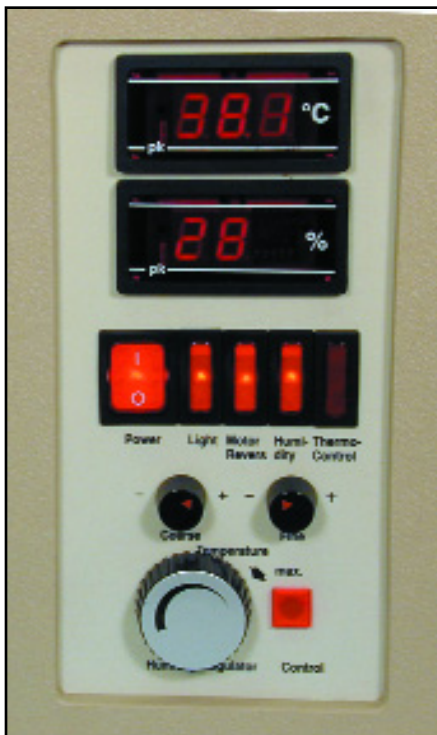
Control panel shown with digital temperature and humidity readouts.