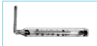
8903 Capillary Thermometer (Centigrade)