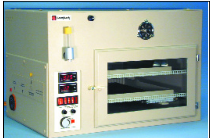
Item shown Compact S84, with Digital Thermometer and Digital Hygrometer. Also shows capillary thermometer and hair hygrometer